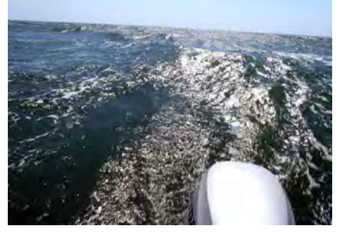
After coming about, retreating back toward the canal with a following sea.

Back into the 6-7 footers, I'm getting concerned. I open the cabin, jump below, grab the PLB [personal EPIRB] and stick it in my pocket, close up the boat, crawl back to the tiller, clip the PLB to my belt, stare at the sea and wonder what I'm doing out here in this little boat. No time to grab my foul-weather jacket (I am already soaked anyway) nor the SAR life jacket, never mind get them on. This situation came on with little warning. I have to stick with the inflatable vest I'm wearing, hope I won't need more and it won't self-inflate prematurely. I think about grabbing the safety harness tether, decide I'm not sure I