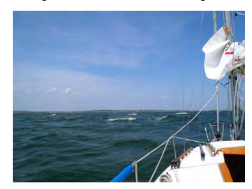
Coming out of Cape Cod Canal into Buzzard's Bay.

The Cape Cod Canal was a challenge shortly after noon with a SW head wind, stronger than I'd anticipated (building to a steady 20 knots, I later learned). Sailing is forbidden in the canal. Most of the way motoring from northeast to southwest in the canal's 5-6 knot ebb current. light spray was coming over the bow. This made photography a bit difficult, cleaning my glasses a regular event. Once out of the canal into Buzzard's Bay I expected clear sailing to West Falmouth. I've experienced the mouths of the Merrimack and Piscatagua Rivers on strong outgoing currents into head winds. It's rough, clashing natural forces until you get through them. I think I'm dealing with the same phenomenon once out beyond the clash the seas will settle. I seem to be wrong and getting wronger, The clash becomes greater,